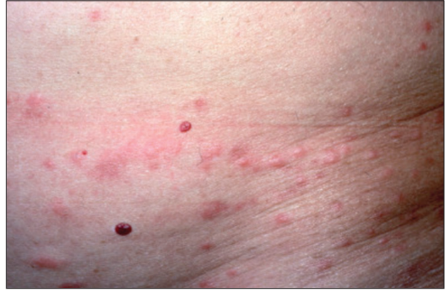
FIGURE 3. Erythematous papules secondary to body lice infestation.

Transmission frequently occurs via physical contact with an affected individual and his/her personal items (eg, linens) via fomites. 4,5 Body louse infestation is more prevalent in homeless individuals who sleep outside vs in shelters; a history of pubic lice and lack of regular bathing have been reported as additional risk factors. 6 Outbreaks have been noted in the wake of natural disasters, in the setting of political upheavals, and in refugee camps, as well as in individuals seeking political asylum. 7 Unlike head and pubic lice, body lice can serve as vectors for infectious diseases including Rickettsia prowazekii (epidemic typhus), Borrelia recurrentis (louse-borne relapsing fever), Bartonella quintana (trench fever), and Yersinia pestis (plague). 5,8,9 Several Acinetobacter species were isolated from nearly one-third of collected body louse specimens in a French study. 10 Additionally, serology for B quintana was found to be positive in up to 30% of cases in one United States urban homeless population. 4